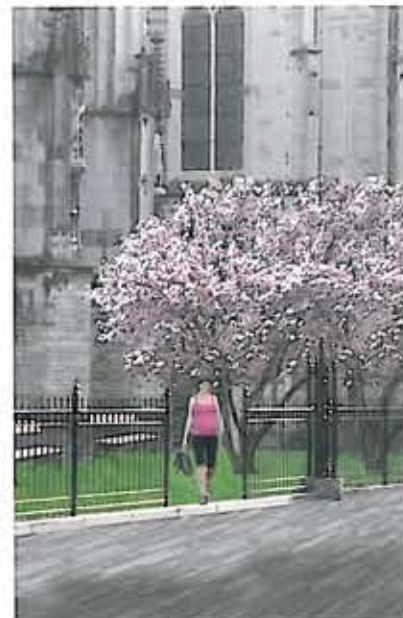
Buro Lubbers (3)